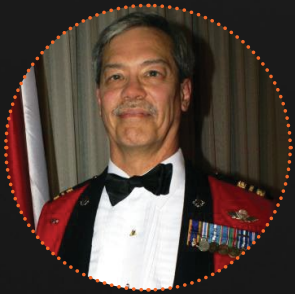
2022 SUPERVISOR OF THE YEAR