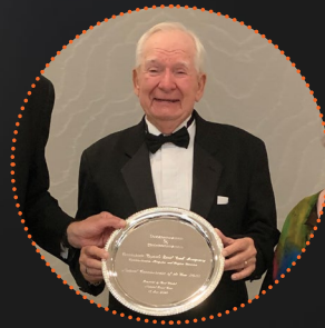
2023 COMMISSIONAIRE OF THE YEAR

Victoria, the Islands and Yukon Division