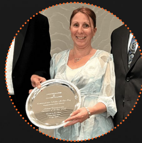
2023 SUPERVISOR OF THE YEAR