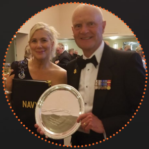
2022 COMMISSIONAIRE OF THE YEAR

Each year, across the entire country, one commissioner is selected as National Commissioner of the Year and one supervisor is selected as National Supervisor of the Year. To learn more, you can find videos and articles featuring these exceptional recipients on our website at commissionaires.ca